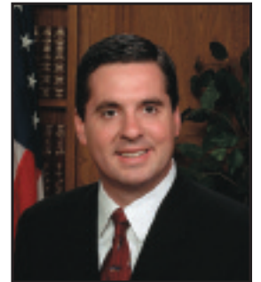
Rep. Devin Nunes

Recently, I was honored to take part in a Congressional Delegation Fact Finding Mission to Iraq. I was invited by Majority Leader John Boehner to take part in this important endeavor, and I am grateful I was able to join my colleagues in investigating part of the defining struggle of my generation. Operation Iraqi Freedom is one phase of the overall plan to bring freedom and democracy to countries that have struggled for years under the rule of dictators and tyrants.