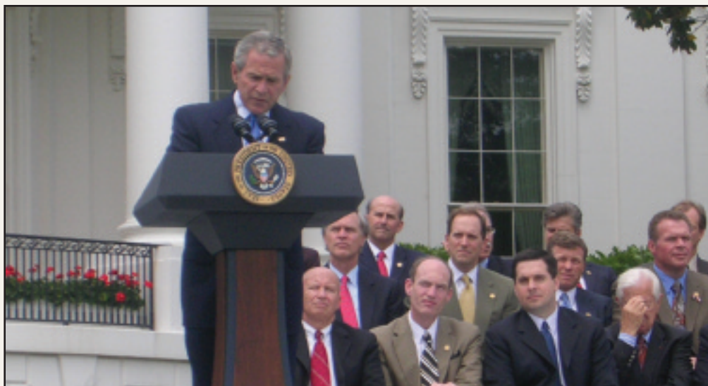
Congressman Nunes joins President Bush and a select group of colleagues on the South Lawn of the White House for the signing of the Tax Increase Prevention and Reconciliation Act.

This would provide much needed clarity for small businesses and family farms in the San Joaquin Valley who